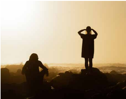
Courtesy of the National Gallery of Art, Washington, D.C.