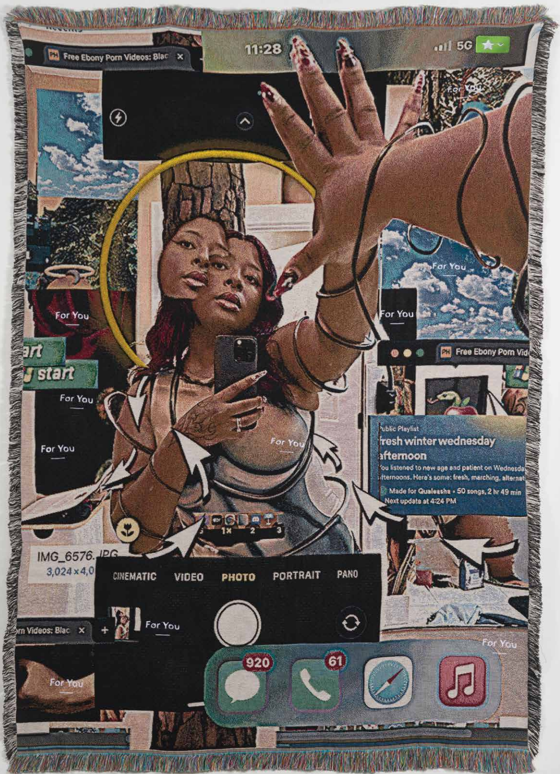
Qualeasha Wood, It's All For U (If U Rilly Want It) , 2024, woven jacquard, glass seed beads and machine embroidery, 59 x 85.5 inches. © Qualeasha Wood. Courtesy of the artist, Gallery Kendra Jayne Patrick, Bern and New York, and Pippy Houldsworth Gallery, London