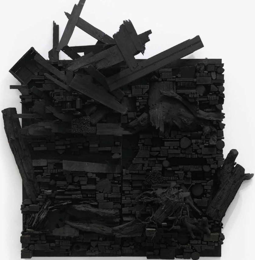
Leonardo Drew, Number 245 , 2020, Wood and paint, 64 x 61 x 14 inches, Courtesy of the Hedy Fischer and Randy Shull Collection of Contemporary Art. © Leonardo Drew. Courtesy Galerie Lelong & Co.