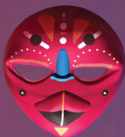
Quincy Woodard, Unspoken Mask (detail) , 2023.