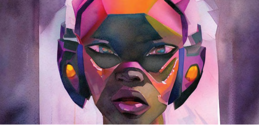
Dominique Katan, Lajè De Vi / Breadth of View (detail) , 2023.